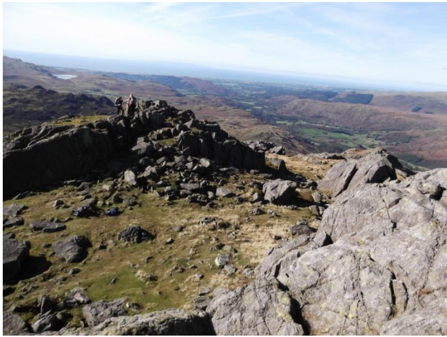
From Harter Fell looking out to the Isle of Mann.