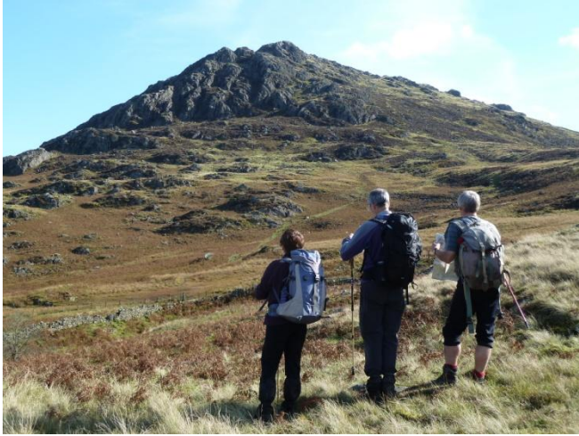
Planning the route up Harter Fell