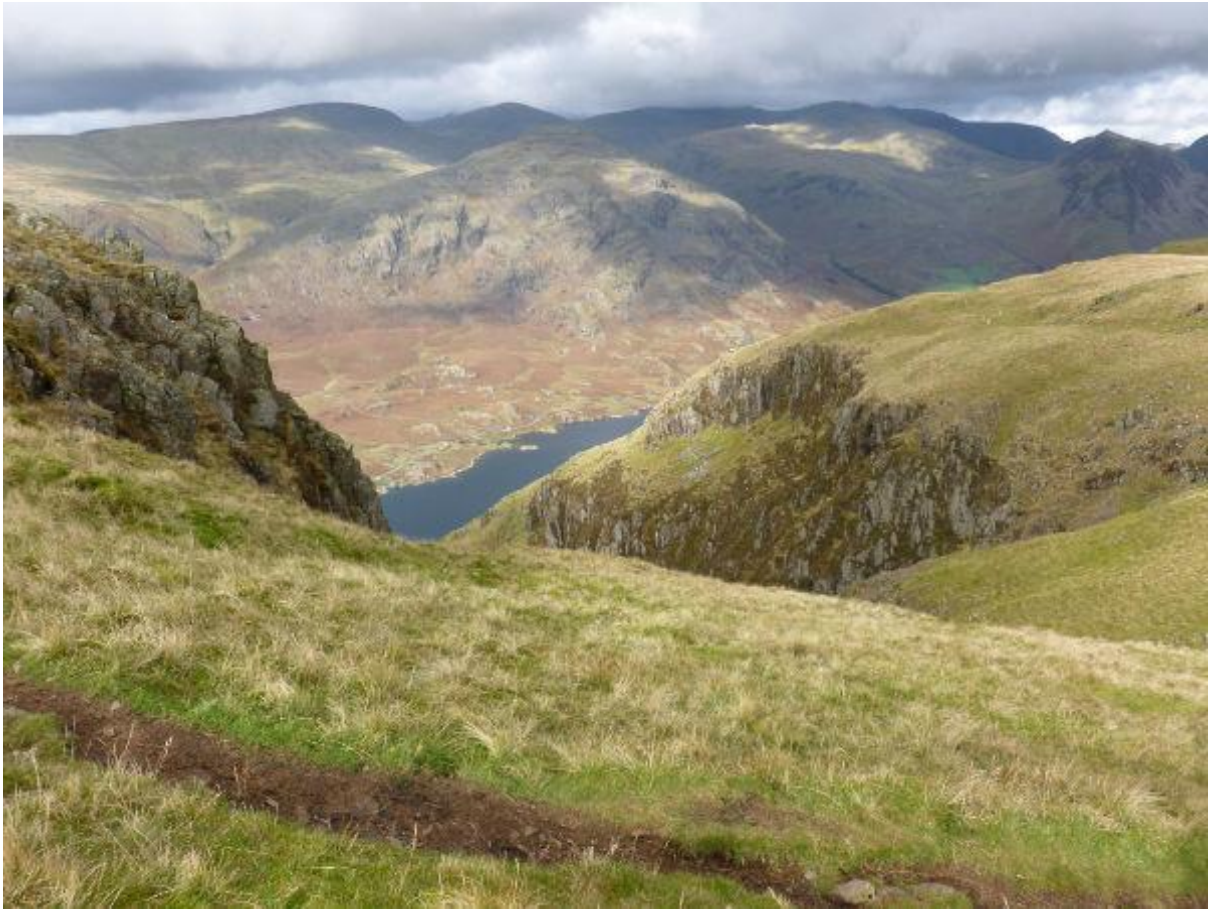
Wast Water from Whin Rigg