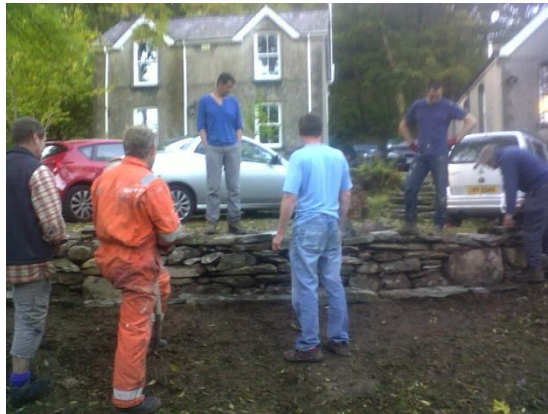
Men at work !!!!!!!!!!!