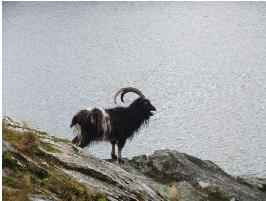
Some pictures from Bonfire meet days out !

Sadly I didn't get many pictures of the bonfire meet itself so if anyone did can they send them to me for inclusion in the next newsletter – thanks ☺