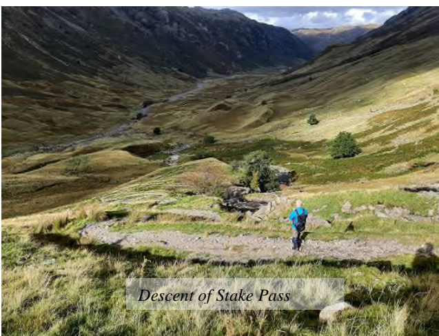
Descent of Stake Pass