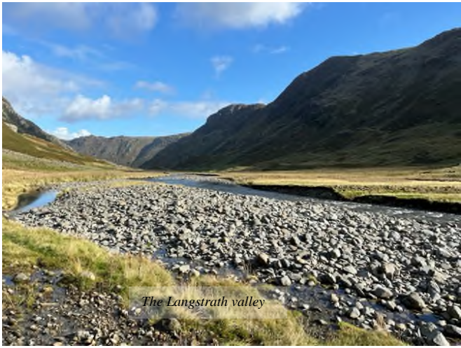
The Langstrath valley