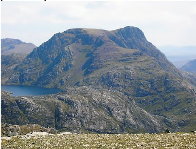
Our view of A Mhaighdean x

From the plateau we did an out and back across a broad ridge of heather clip to claim the Corbett summit of Beinn a Chasgain Mor (2,811'), which increased the already extensive views of the Munros A Mhaighdean and Ruadh Stac Mor to the south. The former is reckoned to be the most remote Munro. A highlight of the ascent was finding a young mountain hare, a leveret, hiding in a shallow scrape or 'form' near the path, something I've never seen before or since. We didn't hang around to take photos as we didn't want to scare it or scare the parents away.