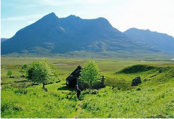
Shenavall bothy, Beinn Dearg Mor

Leaving the track a path goes down to Shenavall bothy, just before 'Scary river 1'. This magical place is one possible source of shelter, the bothy is popular and can be busy.