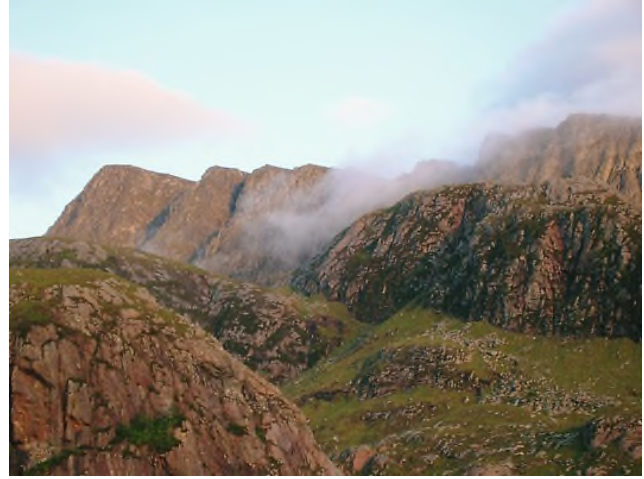
Ben Lair at sunset from Camp 2 x

From Camp 2 we did mighty, cliff strewn Ben Lair (2,821') starting off in a partial temperature inversion, and on the second day Ben Airigh Charr (2,595') and its sidekick Spidean nan Clach (2,306').