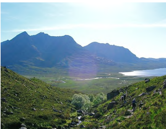
Beinn Dearg Mor and Strath na Sealga from the path

The route is simply superb giving magnificent views. You start at Corriehallie near Dundonnell at GR113850 on the A832 road. The route climbs until you reach the top of the pass to get a breath-taking into the wild moment, the view of Beinn Dearg Mor and the Strath na Sealga.