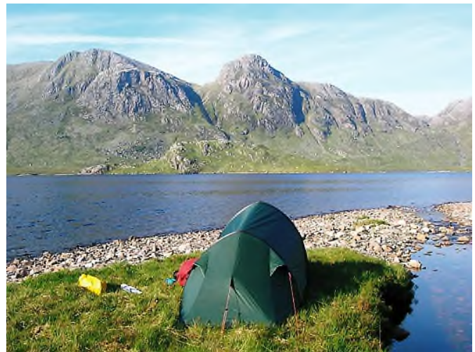
My tent at camp 2 – view of Carnmore climbing cliffs

From the Fionn Loch the path out goes NW across a gradually opening moorland to rejoin landrover tracks at the working farm of Kernsary, a route that gently eases you back into the Rest of the World. This path can be damp in places, but if you've waited for that weather window it shouldn't be too bad. My log of the 2014 trip recalls it as a 'pleasant walk out', and my memory is of constant looks backwards as the bigger hills receded from view. The walk ends with a green woodland stroll by the River Ewe to the car park.