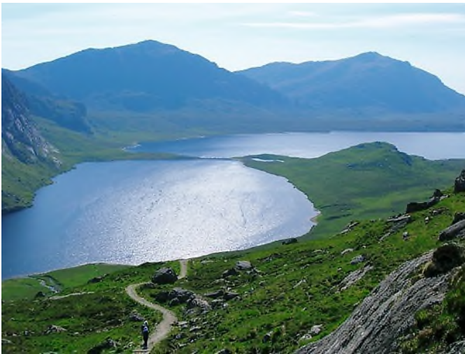
The descent to Carnmore

The route then took us dramatically over the western lip of the high plateau and swings down to Carnmore, a remote house of the shores of Dubh Loch and Fionn Loch. By the house is – when I checked it out in 2014 - a very basic bothy. It could be a further refuge in an emergency. That night we established Camp 2 on some flat ground by the Fionn Loch. It was our base for two days of walking in the area – see more below.