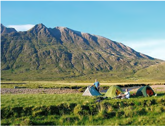
Camp 1 – Mike, Hazel and Al

A quick dash over the boggy bit takes you to Lachrantivore and 'Scary river 2'. This was our Camp 1 bang opposite the mighty An Teallach. The only sounds were the river, the cries of sandpipers, skylarks and the unearthly drumming noise of snipe displaying.