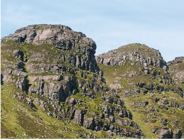
Cliffs of Beinn Dearg Mor