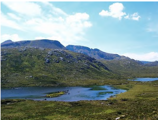
The high lochans, looking west x

From Camp 1 we ascended on a good path up Gleanns na Mhuices Mor and Beag to a lonely plateau and the high lochans Feith Mhic-Illean. I picked up some litter, a discarded full tube of sun cream, we had been plastering it on already because of the very good weather. It turned out a good move as we soon came across some very sunburned German students, the only other people we met en route, and I was able to give them my find to help out.