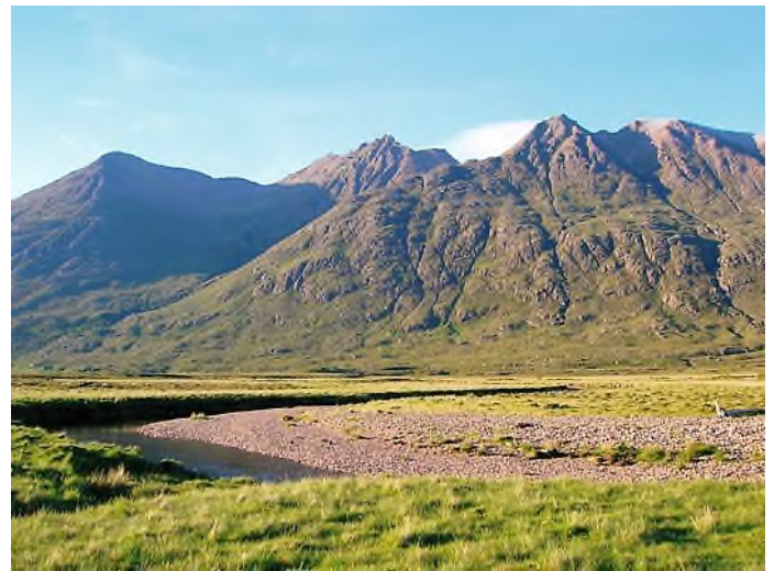
Camp 1 – 'Scary river 2' and An Teallach

From Camp 1 we ascended on a good path up Gleanns na Mhuices Mor and Beag to a lonely plateau and the high lochans Feith Mhic-Illean. I picked up some litter, a discarded full tube of sun cream, we had been plastering it on already because of the very good weather. It turned out a good move as we soon came across some very sunburned German students, the only other people we met en route, and I was able to give them my find to help out.