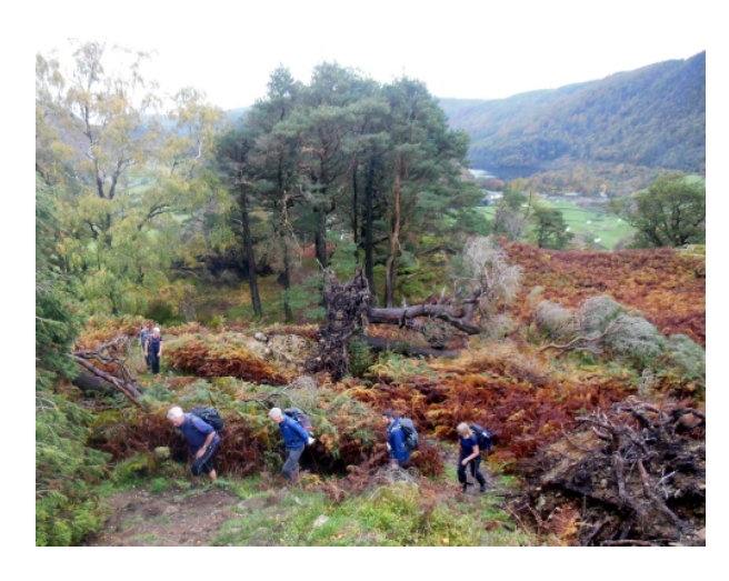
Beautiful autumn colours for the St Johns in the Vale meet