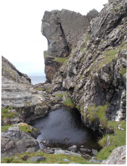
I returned pretty much by the way I'd come out, but had the bonus of a fantastic evening swim at Killoran Bay.