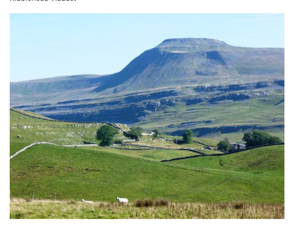
Ingleborough from Twisleton Scar