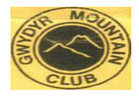
Promoting Interest in Mountain Activities