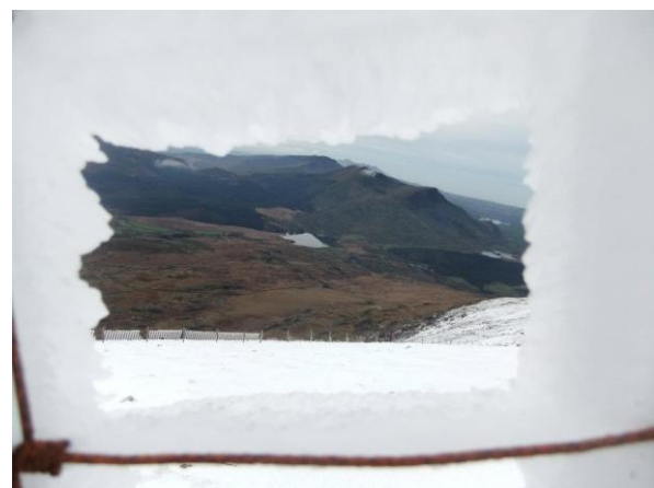
An 'arty' shot of Mynedd Mawr!