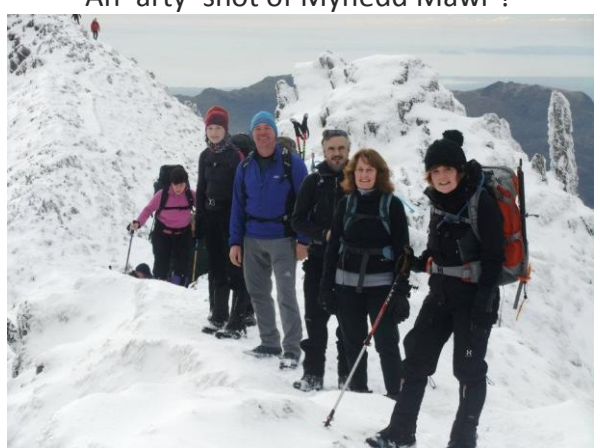
At last! We made the south ridge!!