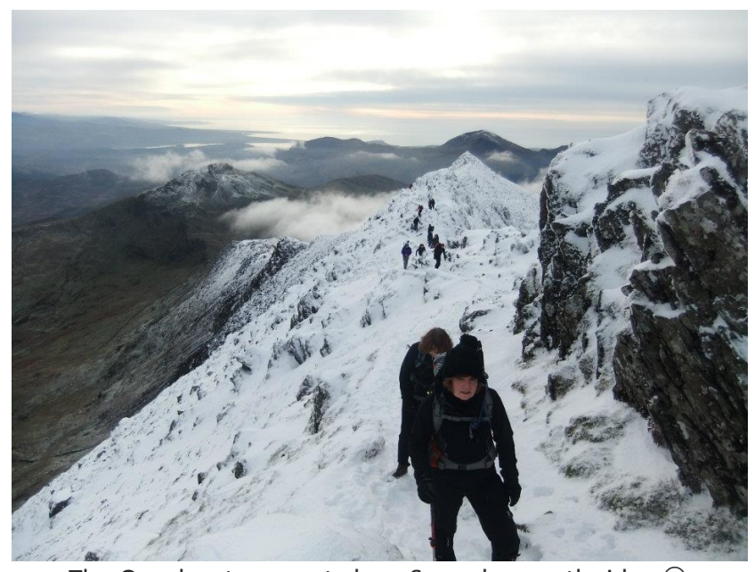
The Gwydyr strung out along Snowdon south ridge