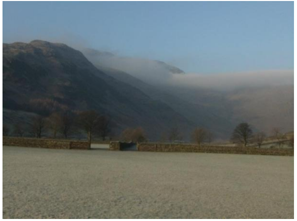
Towards Bowfell from Stool End Farm