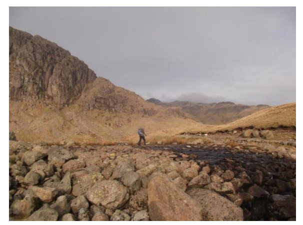
Yours truly on a perilous stream crossing !!!