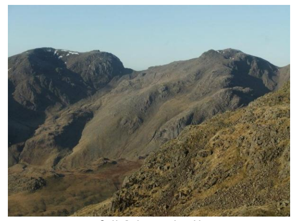
Scafell & her Pike!!