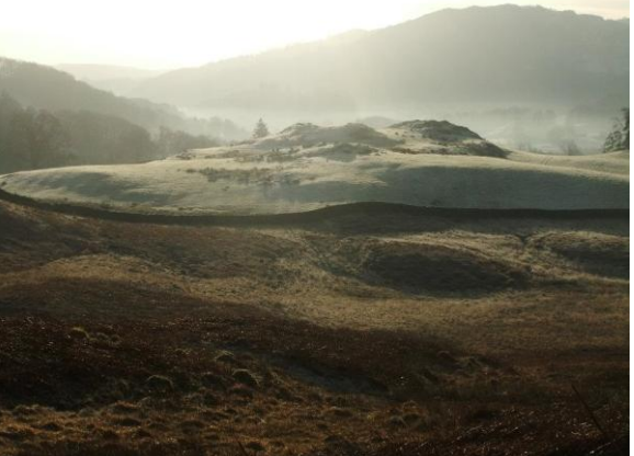
A frosty Little Langdale and Elterwater on Sunday morning.