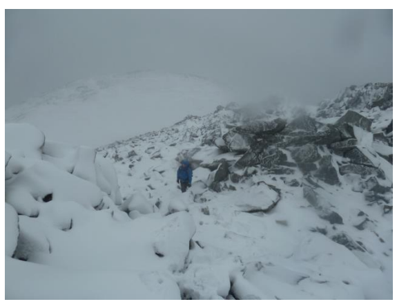
Kev approaching the summit of Filliast!