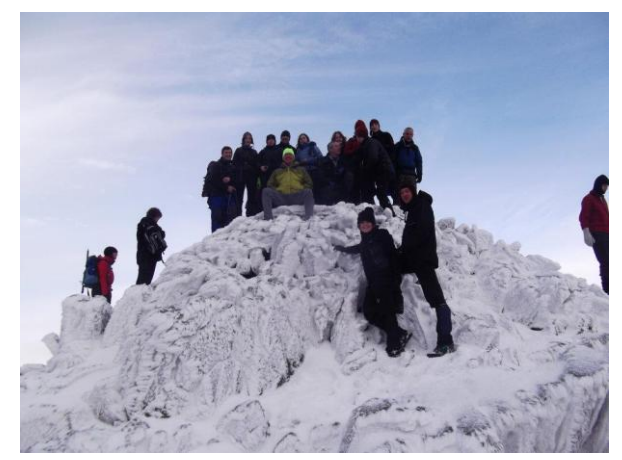
Lunch - at last!