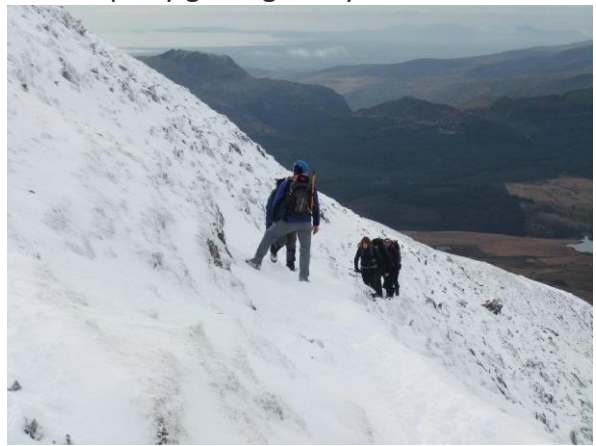
Approaching the south ridge