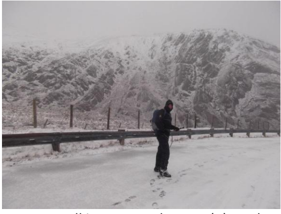
Me walking out on the Dam(n) road