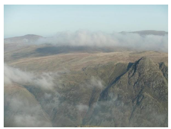
Pike O'Stickle from Bowfell