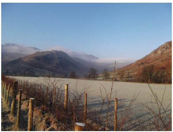
Bethan photo of a frosty Langdale ©

A really great weekend out, one can only hope it is to be the first of many this year.