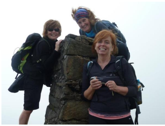
On Siabod's summit