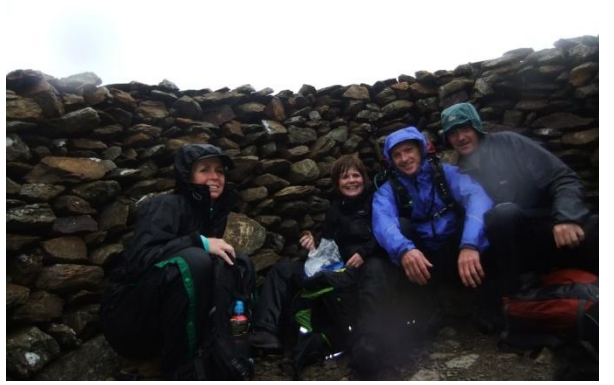
Like I said − pretty windy ©