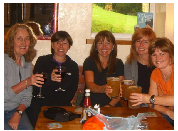
A tad wet methinks 🕾